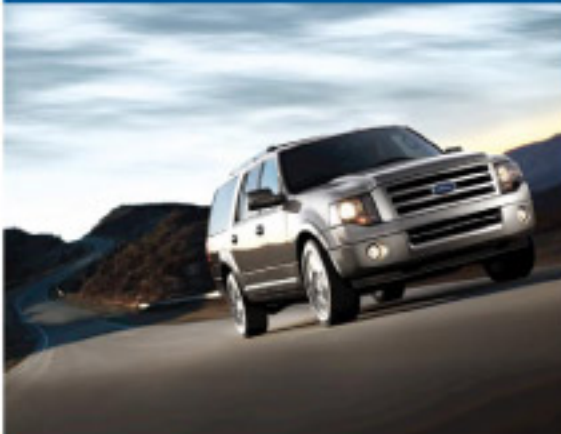
2009 Ford Expedition