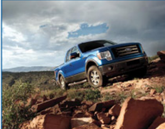
2009 Ford F-150