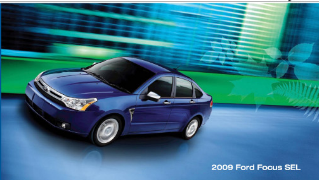
2009 Ford Focus SEL