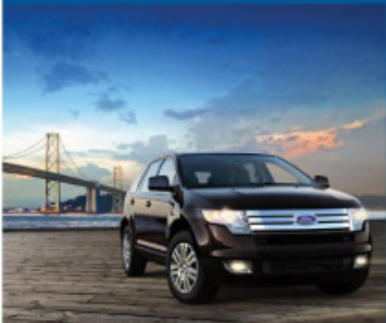
2009 Ford Edge LTD