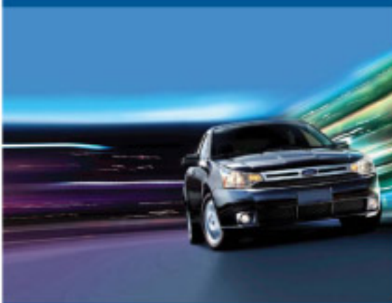
2009 Ford Focus SES

106 years ago a company was founded on the premise that an automobile should be affordable to everyone.