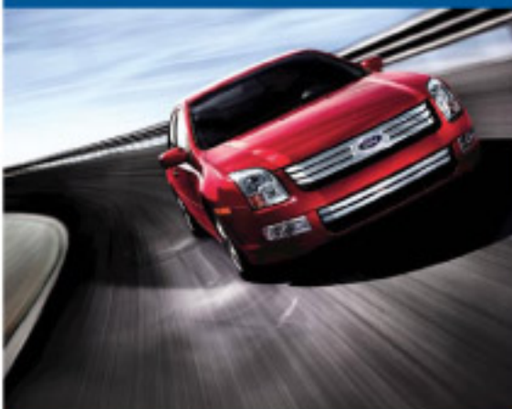
2009 Ford Fusion SEL